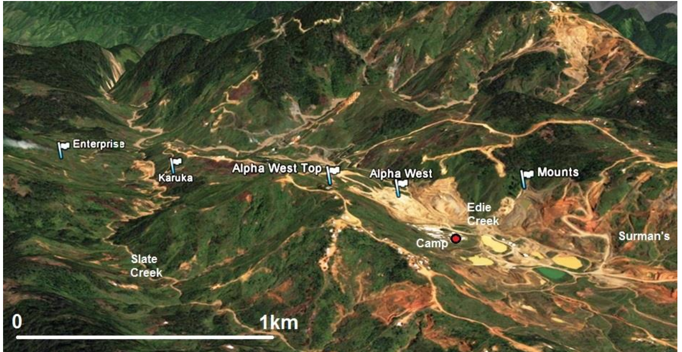
Figure 1: Edie Creek oblique Google Earth view showing location of infrastructure, vein systems and main targets.

EDD 025 was collared towards the Eastern-end of the Karuka-Enterprise stock-work and diatreme zone, to the west (left) of Slate Creek between the Karuka and Enterprise flags in Figure 1 below.